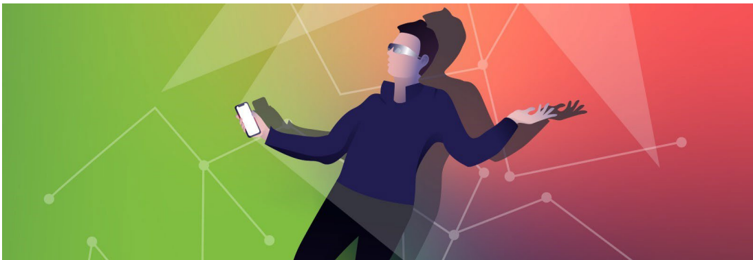
Image Description: In the center there is a man with sunglasses on, his arms are extended to the side and in his left hand he holds a smartphone. In the background, there is lime green on the left and a red-orange on the right, with faded constellations.

Saturday, March 2 nd at 2pm Sagebrush Theatre (1300 9 th Avenue)